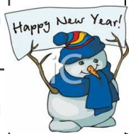
Youth Xmas Party Reindeer Games????