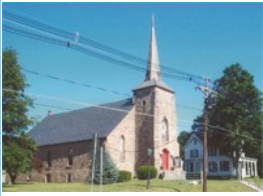
Kirkpatrick Memorial Presbyterian Church