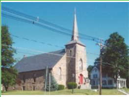
Kirkpatrick Memorial Presbyterian Church